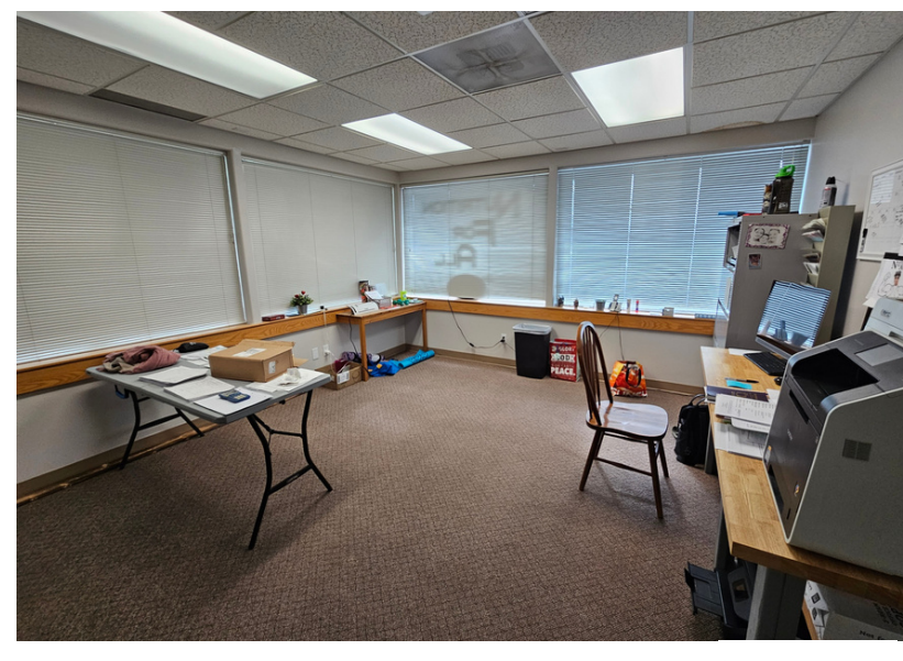
The information contained herein has been obtained from sources we understand to be reliable. Whilst we do not doubt its accuracy it has not been verified & we make no guarantees, warranty, or representations about it. Any projections, opinions, assumptions or estimates used are for example only. You & your advisors should conduct a careful independent investigation of the property to determine the property's satisfaction to your needs. © Woodford Commercial Real Estate.