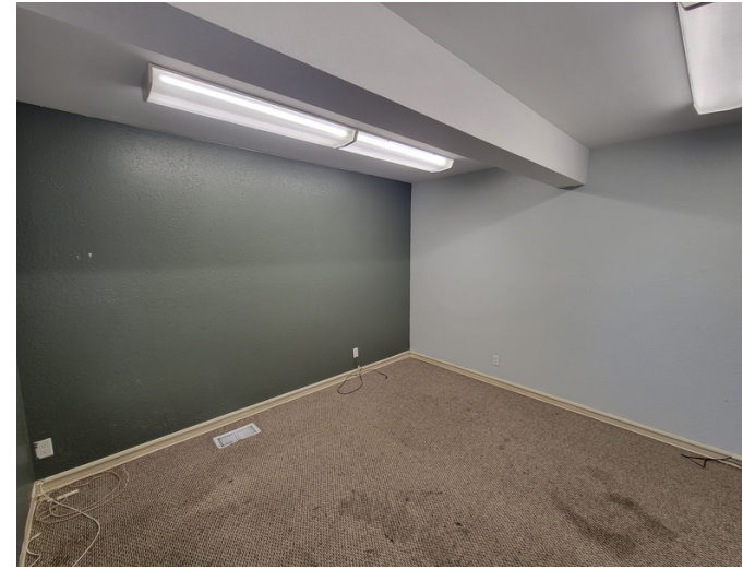
Suite 8 & 9